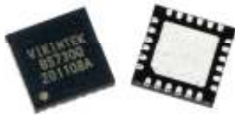
4X4 mm QFN24